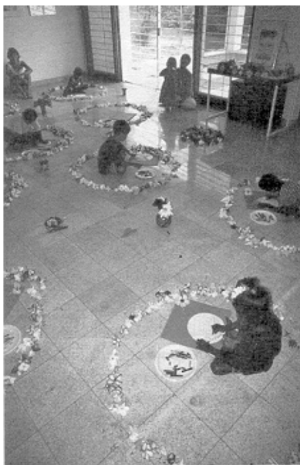
Children from the Auroville Kindergarten at an innovative education session in the Savitri Bhavan hall.