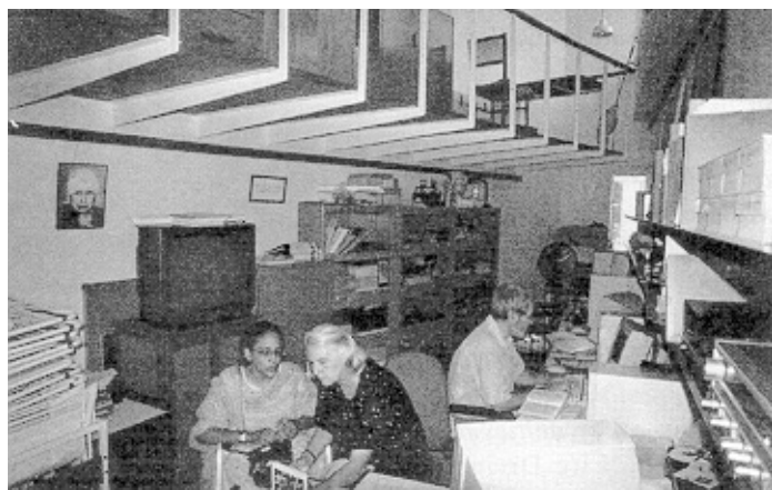
Researchers at work in Savitri Bhavan