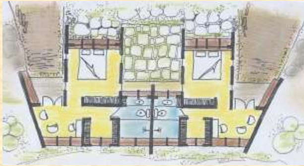
Floor plan of apartments